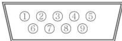
Male DSUB 9Pin (outside view)